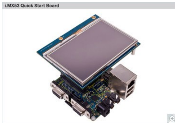
Freescale iMX53 QuickStart X1 Cortex A8 1 GHz, SATA