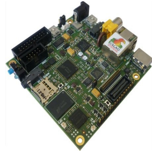
ST-Ericsson Snowball X2 Cortex A9 with Mali GPU