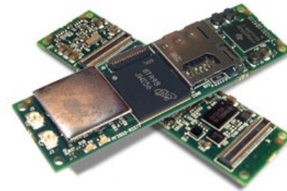
Gumstix Overo X1 Cortex A8 with SGX530 GPU