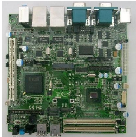
Atom N450 Mini-ITX Single core, “integrated graphics”