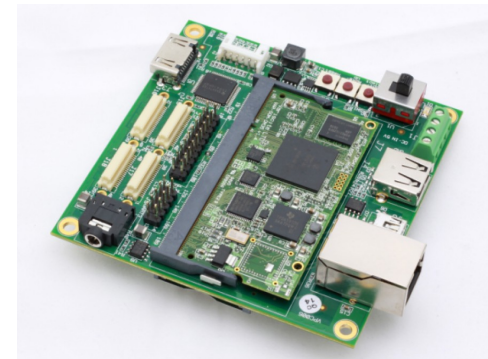
Variscite AM35 X1 Cortex A8 600 MHz, CAN bus