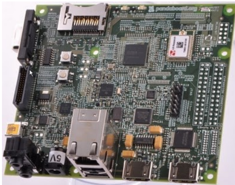
Pandaboard X2 Cortex A9 with SGX540 GPU